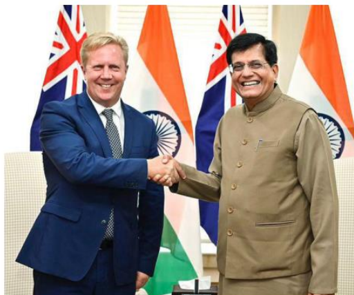
Deep dive: Commerce Minister Piyush Goyal with New Zealand Trade Minister Todd McClay in New Delhi on Sunday.

Prime Minister of New Zealand Christopher Luxon is here on a four-day vi-