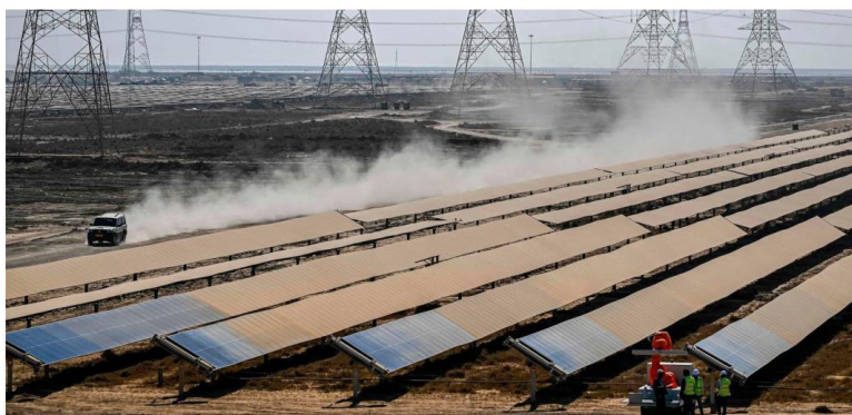
Workers install solar panels at the Adani Group-owned Khavda Renewable Energy Park in Khavda, Gujarat.

"This variation depends on atmospheric variables such as clouds, aerosols or particulate matter, water vapour, and radiatively active gas molecules such as ozone. Clouds reflect and aerosols either scatter or absorb incoming solar radiation reaching the surface. Therefore, on a cloudy or hazy day, due to particulate matter pollution, less solar radiation will impinge on the solar panel and reduce solar generation."