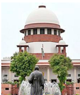
The court said Indian language laws were not rigid but accommodative. FILE PHOTO

"Though Hindi was selected as the official language, it could not be described as the national language, for, it was not the language generally spoken in all parts of India, and though spoken by the largest single group of people, that group did not constitute the majority of people in