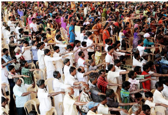
Criminal by 'habit': Members of various denotified tribes take an oath during the first conference of Itinerant People's Rights Organisation in 2012. FILE PHOTO

By this time, States had already started enacting "habitual offender" laws across the country, such as the Madras Restriction of Habitual Offenders Act, 1948, which was extended to Delhi in 1951. Rajasthan passed a similar law in 1953, and over the next two decades more