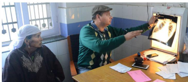
In India, women face challenges such as under-diagnosis and financial barriers while accessing treatment. File photograph used for representational purposes only

A recently published paper titled “Women and tuberculosis care in India: a scoping review” notes that while the variables that impacted women in the past, particularly gender roles and norms, seem to be waning over time, they cannot be ignored in the present. The focus that the government of India is placing on gender equity serves as a reminder that