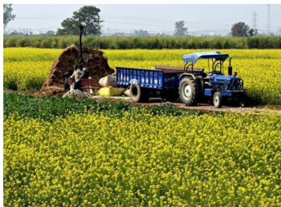
Awaiting hearing: Petitioners have challenged the Environment Ministry's approval for cultivation of GM mustard.

Science Minister Jitendra Singh who was also at the event, said, "There is so much dynamism in bio-