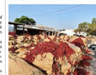
Chilli bags kept for auction at the Byadgi APAC yard.

I write to you with deep concern for the habits of red chilli farmers in Karnataka, particularly in the Karnataka Karnataka region, who are facing an unprecedented crisis due to the drastic fall in market prices," he said in his letter.