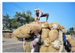
Workers unloading chilli bags at the Byadgi APAC yard on Thursday.

What has caused concern yet again this year is the further dip in the prices, leading to sporadic protests not in Byadgi but in far-off places like Ka-