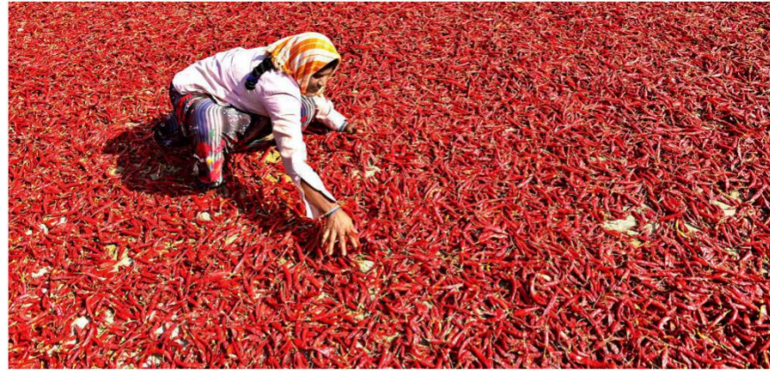
The plagues in February 2024, the average price for Byadgi Kaddi, Byadgi Dabbi, and Guntur varieties stood at ₹25,098, ₹38,951, and ₹13,509 a quintal, respectively. On Thursday, they were ₹23,358, ₹25,809, and ₹12,239, a quintal respectively. (Hindu)

Byadgi chilli farmers are facing financial distress as prices have plummeted due to oversupply, stockpiling, and stricter export regulations.