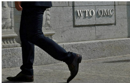
A logo outside the WTO in Geneva, Switzerland.