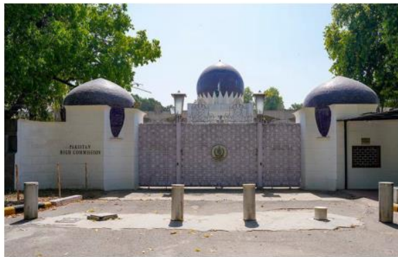
India on Wednesday announced a five-pronged response targeting Pakistan against the backdrop of the attack. PTI

“Medical visas issued to Pakistani nationals will be valid only till April 29, 2025. All Pakistani nationals currently in India must leave India before the expiry of visas, as now amended. Indian nationals are strongly advised to avoid travelling to Pakistan. Those Indian nationals currently in Pakistan are also advised to return to India at the earliest,” the External Affairs Ministry said, announcing that the “Go-