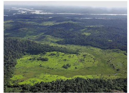
A deforested area in the border of Xingu river, northern Brazil, in the Amazon rain forest. FILE PHOTO