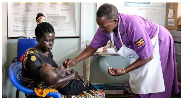
Challenges remain: A nurse assistant administering malaria vaccine on a child in Uganda. April 25 has been recognised by the World Health Organization (WHO) as World Malaria Day.

Before these discoveries, European colonial efforts in Africa were severely constrained by extraordinarily high mortality rates. In coastal African colonial trade posts, European troop mortality averaged 500 deaths per 1,000 soldiers annually in the 1800s, with those venturing inland facing even worse