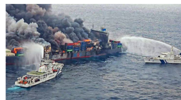
Coast Guard ships Samudra Prahari and Sachet working to douse the fire on M.V. Wan Hai 503 on Tuesday.

The ship is tilting approximately 10 to 15 de-