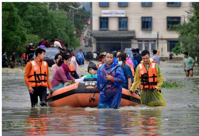
Quick response: NDRF members evacuate patients and staff members from the flood-affected Jawaharlal Nehru Institute of Medical Sciences in Imphal East, Manipur, on Sunday.

The Indian Air Force (IAF) on Sunday rescued 14 people who were stranded in the middle of the flooded Bomjir river in the Lower