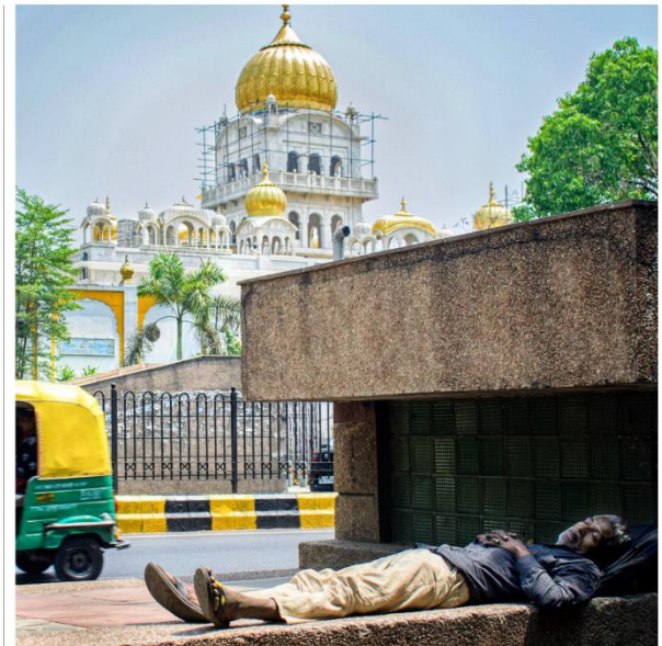
Many heat-related fatalities occur outside hospitals – homes, construction sites, or village farms – where medical aid and death certification may not be accessible. AU

According to the McKinsey Global Institute, heat-related productivity losses could jeopardise between 2.5% and 4.5% of India's annual Gross Domestic Product by 2030, underscoring the urgent need for adaptive policies.