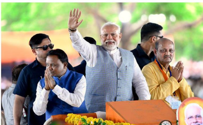
Celebrating a milestone: Narendra Modi greets supporters as he arrives at the Janata Maidan in Bhubaneswar on Friday to mark the anniversary of the BJP government in the State.

Dedicating and laying the foundation for 105 projects worth almost ₹19,000