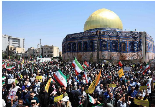
On the boil: Iranians gather for an anti-Israel rally next to a replica of the Dome of the Rock mosque in Tehran on Friday.

"The good result today is that we leave the room with the impression that the Iranian side is ready to further discuss all the important questions," said German Foreign Minister Johann Wadepuhl in a statement alongside his