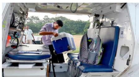
The report dated June 19 followed a review of organ transplant activities. C. VENKATACHALAPATHY

The report elaborated on the lack of facilities in government healthcare institutions, saying a significant number of government hospitals had