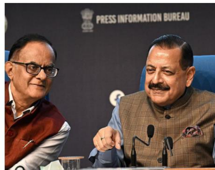
Jitendra Singh and Ajay Kumar Sood, Principal Scientific Adviser during a press conference in New Delhi on Monday.

He was responding to a question on why, despite the government's multiple