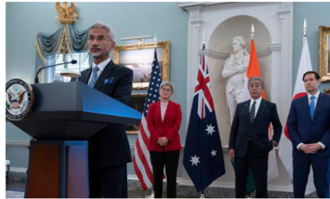
External Affairs Minister S. Jaishankar with Australian Foreign Minister Penny Wong, Japanese Foreign Minister Takeshi Iwaya and U.S. Secretary of State Marco Rubio in Washington DC.

Mr. Jaishankar reiterated India's commitment to a rules-based international