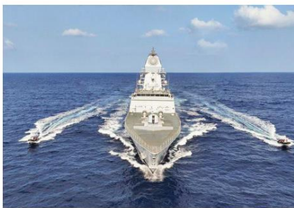
Udaygiri , the second ship of Project 17A stealth frigate, was delivered to the Indian Navy on Tuesday.

These multi-mission frigates are capable of operating in a 'blue water' environment – referring to the open ocean – dealing with both conventional and non-conventional threats in the area of India's maritime interests, the Ministry said, adding that the remaining five ships will be