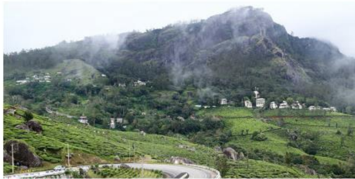
Land of beauty: A view of the Munnar hill station from the Anayirankal gap in Idukki. JOMON PAMPAVALLEY

According to an official order, the government will develop Munnar as a 'net-zero tourist destination (minimising the carbon footprint of tourists)' by "protecting the delicate