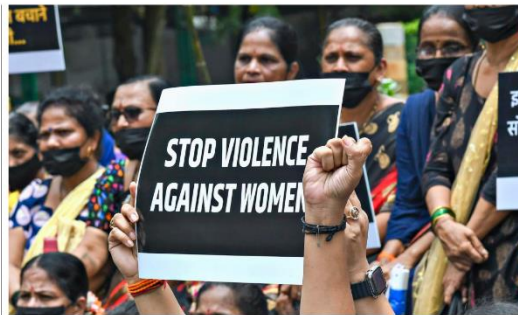
Call to action: A silent protest calling for an end to violence against women in Mumbai. Intimate partner violence has been identified as a significant and measurable contributor to a wide range of health issues.

This enables a crucial paradigm shift. Domestic violence is no longer a social issue but a risk factor that impacts health. Intimate partner violence is an insidious exposure that accumulates over years, shaping mental illness, non-communicable disease, and long-term disability rather than presenting as a single, identifiable event.