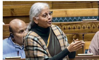
Union Finance Minister Nirmala Sitharaman speaks in Lok Sabha during the Winter session of Parliament on Thursday

This will include the Chairperson, two officers appointed by the Central Government and one from the RBI as ex-officio members, and 11 others, of whom at least five will be