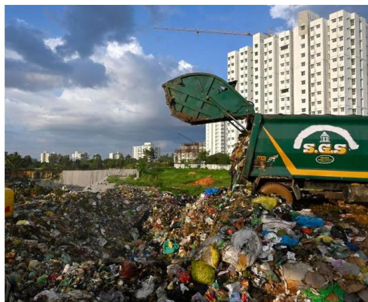
New methods: Garbage being dumped in the Mittanagahalalli landfill in Bengaluru in 2024. FILE PHOTO

India's rapid industrialisation has come at