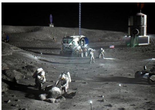
An artist's illustration of a future Aramis Base Camp operated by NASA

Legal vacuum The international framework for nuclear power in space is based on the 1922