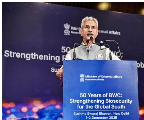
External Affairs Minister S. Jaishankar addressing a conference on the Biological Weapons Convention in New Delhi on Monday.

'No compliance system' "It has no compliance system, it has no permanent technical body and no mechanism to track new