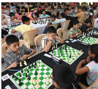
Strong opening: The study found well-performing children started in their field early and showed higher levels of discipline-specific practice compared to sub-elite performers in the same age group. (A) (A) (A)

How could multidisciplinary practice help? The authors had three hypotheses: (i) engaging with multiple disciplines early