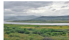
Dark clouds loom over the catchment area of the Cauvery in Salem, Tamil Nadu. FILE PHOTO

Indian deltas now mirror global examples like the Nile, Mississippi and Po, where sediment starvation has accelerated land loss.