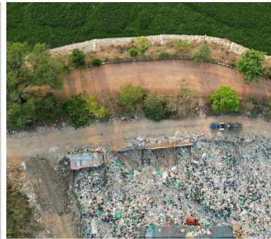
Choking dilemma: An aerial view shows a landfill next to a lake swathed in water hyacinth in Bengaluru on April 15, 2019.

Although the draft Rules were published on December 14, 2024, inviting objections and suggestions from the public, the deeper flaw lies in a familiar pathology of Indian governance: the belief that