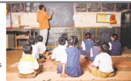
TABLE 1: Educational aspirations during both rounds of interview (in %)

The data for the charts were sourced from UDAYA - Understanding the Lives of Adolescents and Young Adults