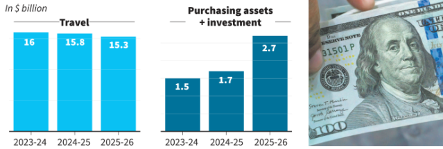
Source: RBI • Note: Data is for spending under the Liberalised Remittances Scheme for the first 11 months of each year

Indians are increasingly spending on foreign investments while expenditure on foreign travel has been declining