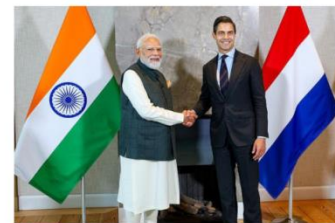
Diplomatic visit: Prime Minister Narendra Modi with his Dutch counterpart Rob Jetten at a meeting in The Hague on Saturday.

'New momentum' Mr. Modi said the meetings had added a "new momentum" to the India-Netherlands ties. "From elevating our relationship to a Strategic Partnership to expanding cooperation in water resources, semiconductors, innovation, defence, sustainability and mobility, we have charted an ambitious road map for the future," he said in a social media post after leaving the Netherlands. Mr. Modi flew to Sweden on Sunday for a half-day stop as part of his five-nation week-long visit, which will bring him to Oslo on Monday for bilateral talks and the Nordic-India Summit.