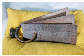
The Chola-era copper plates, which were handed back to India by the Netherlands, on Saturday, and, right, the tower of the Buddha vihara, called Chulamanivarman Vihara, near Nagapattinam in Tamil Nadu, which was demolished by Jesuit priests in 1867. #1

"We should make efforts to bring back the Velvikudi copper plates issued by