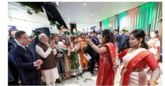
Prime Minister Narendra Modi being welcomed in Gothenburg, Sweden. Swedish Prime Minister Ulf Kristersson is present.

India and Norway are expected to announce three government-to-government MoUs which will focus on health cooperation, digital infrastructure and space ties. At least 18 MoUs are expected between businesses during the visit, many of which will be in the field of energy. "We are discussing more and more what we can do together on energy, and we are expecting several business-to-business MoUs on the energy side," Norwegian Ambassador to India May-Elin Stener told The Hindu , citing a big consignment of LNG delivered to India last week, part of a 15-year deal with Norwegian energy major Equinor.