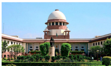
The Supreme Court of India.

PR: The difficulty with Article 136 is that there has never been a clear consensus, even within