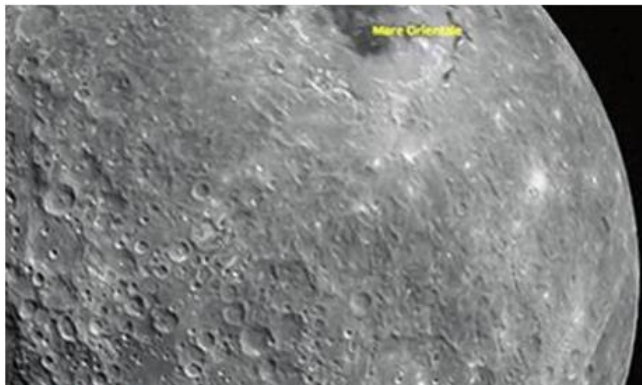
Lunar shades: In the study, the scientists focused on special craters located in permanently shadowed regions of the moon.

In this study, the scientists focused on doubly