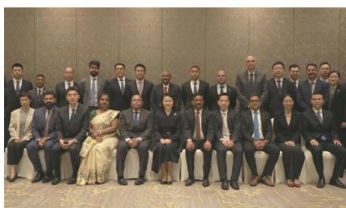
Fruitful talks: Representatives from India and China at the 35th WMCC meeting held in Beijing on Wednesday.

According to the Ministry of External Affairs (MEA), the two sides reviewed the situation along the India-China border and expressed satisfaction over the progress made in maintaining peace and tranquillity in border areas, which they said had contributed